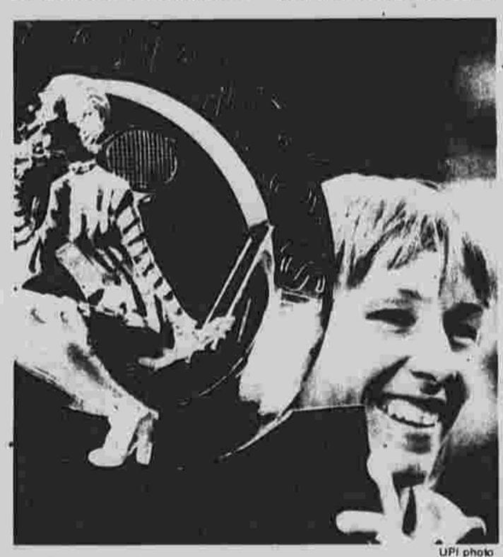
Martina Navratilova holds the trophy after winning the Virginia Slims Tennis Championships Sunday in New York.